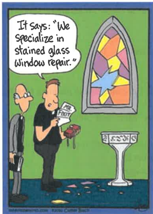
Cartoon by Inherit the Mirth