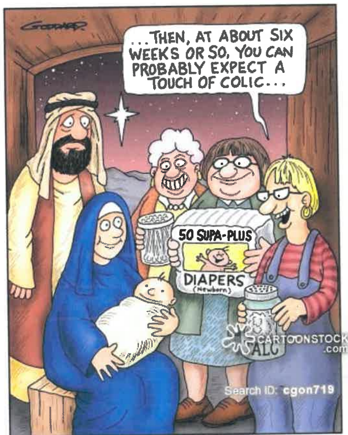
Three Wise Women