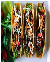
This Photo by

More information on Decode Zone can be found on their website: