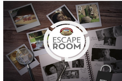
This Photo by Unknown Author is